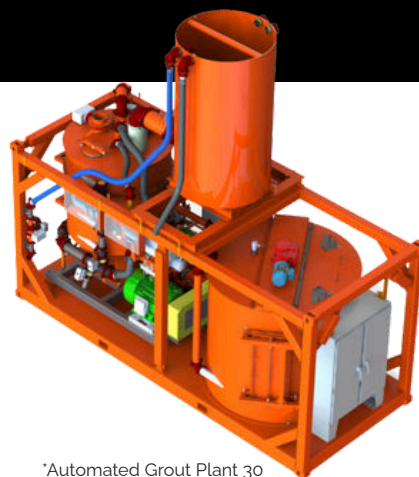
*Automated Grout Plant 30

The AGP is built for durability and performance, producing stable, bleed-resistant mixes with excellent flow. Designed for abrasive materials, it features wear-resistant components and fewer moving parts for easier maintenance and reliable operation.